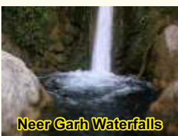
Neer Garh Waterfalls