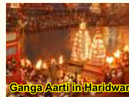
Ganga Aarti in Haridwar