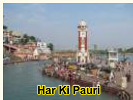
Har Ki Pauri